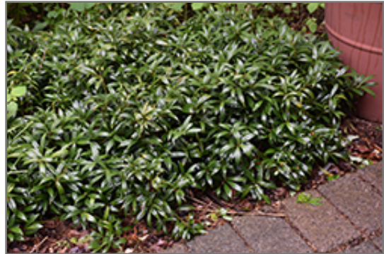
Himalayan Sweet Box

Himalayan Sweet Box is recommended for the following landscape applications;