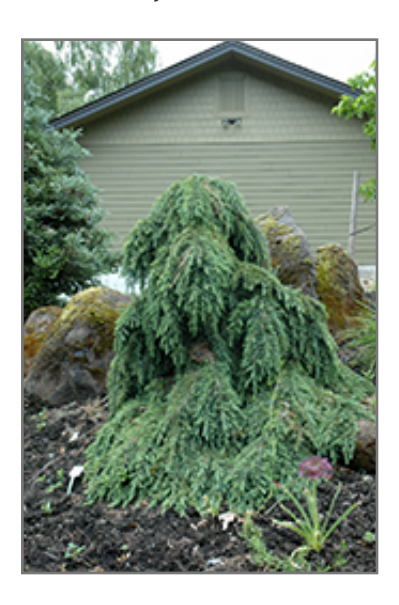
Feelin' Blue Deodar Cedar