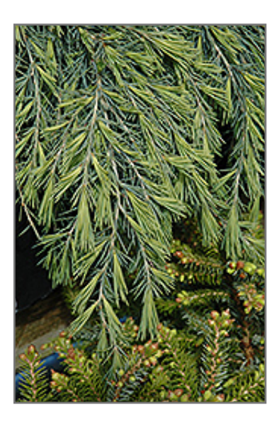
Feelin' Blue Deodar Cedar foliage