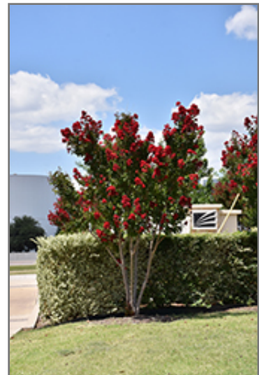
Dynamite Crapemyrtle in bloom