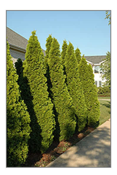
Emerald Green Arborvitae