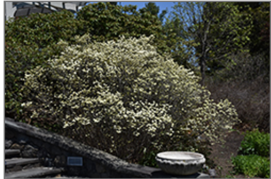
Dwarf Fothergilla in bloom

Dwarf Fothergilla is recommended for the following landscape applications;