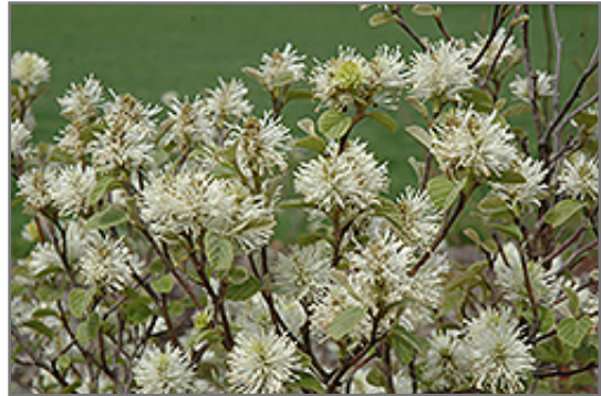
Dwarf Fothergilla flowers

This shrub does best in full sun to partial shade. It requires an evenly moist well-drained soil for optimal growth, but will die in standing water. It is not particular as to soil type, but has a definite preference for acidic soils, and is subject to chlorosis (yellowing) of the foliage in alkaline soils. It is somewhat tolerant of urban pollution. This species is native to parts of North America.