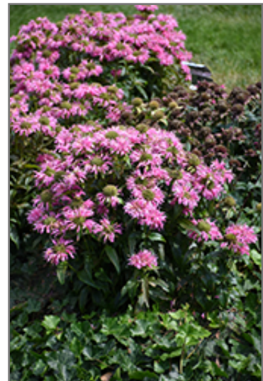
Pardon My Pink Beebalm in bloom