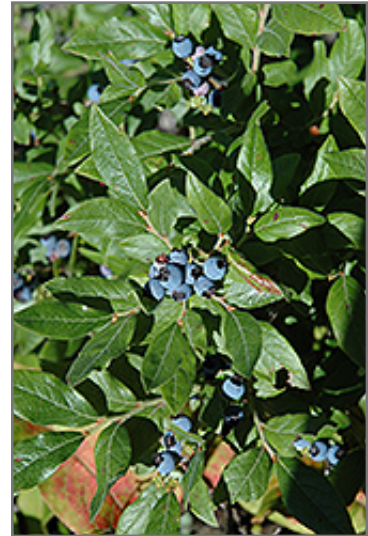
Lowbush Blueberry fruit

Lowbush Blueberry features dainty clusters of white bell-shaped flowers with shell pink overtones hanging below the branches in mid spring. It has dark green deciduous foliage. The oval leaves turn an outstanding scarlet in the fall. It features an abundance of magnificent blue berries in mid summer.