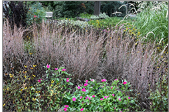
Standing Ovation Bluestem in fall

Standing Ovation Bluestem is recommended for the following landscape applications;