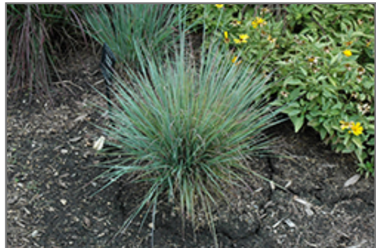
Standing Ovation Bluestem