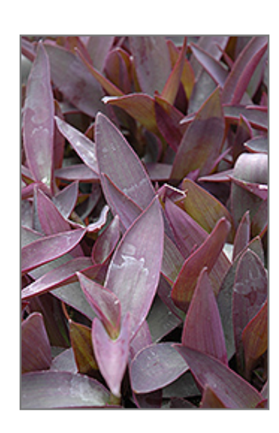
Purple Heart foliage

There are many factors that will affect the ultimate height, spread and overall performance of a plant when grown indoors; among them, the size of the pot it's growing in, the amount of light it receives, watering frequency, the pruning regimen and repotting schedule. Use the information described here as a guideline only; individual performance can and will vary. Please contact the store to speak with one of our experts if you are interested in further details concerning recommendations on pot size, watering, pruning, repotting, etc.