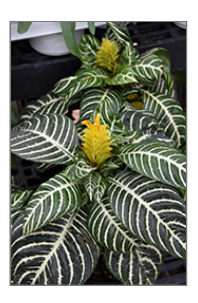
Zebra Plant in bloom

When grown indoors, Zebra Plant can be expected to grow to be about 24 inches tall at maturity extending to 3 feet tall with the flowers, with a spread of 24 inches. It grows at a medium rate, and under ideal conditions can be expected to live for approximately 10 years. This houseplant should only be grown away from direct sunlight or in a room with strong artificial light. It prefers to grow in average to moist soil. The surface of the soil shouldn't be allowed to dry out completely, and so you should expect to water this plant once and possibly even twice each week. Be aware that your particular watering schedule may vary depending on its location in the room, the pot size, plant size and other conditions; if in doubt, ask one of our experts in the store for advice. It is not particular as to soil type or pH; an average potting soil should work just fine.