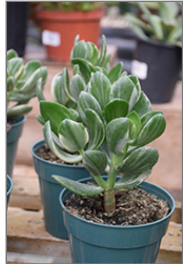
Variegated Jade Plant in full

This is a multi-stemmed evergreen houseplant with an upright spreading habit of growth. This plant can be pruned at any time to keep it looking its best.