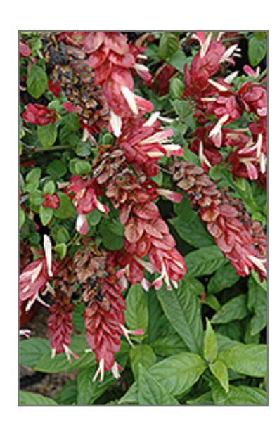
Shrimp Plant flowers

There are many factors that will affect the ultimate height, spread and overall performance of a plant when grown indoors; among them, the size of the pot it's growing in, the amount of light it receives, watering frequency, the pruning regimen and repotting schedule. Use the information described here as a guideline only; individual performance can and will vary. Please contact the store to speak with one of our experts if you are interested in further details concerning recommendations on pot size, watering, pruning, repotting, etc.