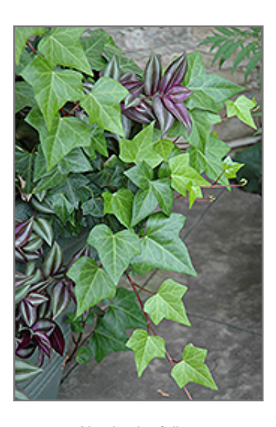
Algerian Ivy foliage

When grown indoors, Algerian Ivy can be expected to grow to be about 10 feet tall at maturity, with a spread of 3 feet. It grows at a fast rate, and under ideal conditions can be expected to live for approximately 30 years. This houseplant performs well in both bright or indirect sunlight and strong artificial light, and can therefore be situated in almost any well-lit room or location. It is very adaptable to both dry and moist soil, and should do just fine under average home conditions. The surface of the soil shouldn't be allowed to dry out completely, and so you should expect to water this plant once and possibly even twice each week. Be aware that your particular watering schedule may vary depending on its location in the room, the pot size, plant size and other conditions; if in doubt, ask one of our experts in the store for advice. It is not particular as to soil pH, but grows best in rich soil. Contact the store for specific recommendations on pre-mixed potting soil for this plant. Be warned that parts of this plant are known to be toxic to humans and animals, so special care should be exercised if growing it around children and pets.