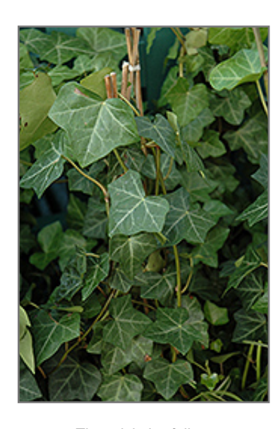
Thorndale Ivy foliage

When grown indoors, Thorndale Ivy can be expected to grow to be about 10 feet tall at maturity, with a spread of 3 feet. It grows at a fast rate, and under ideal conditions can be expected to live for approximately 30 years. This houseplant performs well in both bright or indirect sunlight and strong artificial light, and can therefore be situated in almost any well-lit room or location. It prefers to grow in average to moist soil. The surface of the soil shouldn't be allowed to dry out completely, and so you should expect to water this plant once and possibly even twice each week. Be aware that your particular watering schedule may vary depending on its location in the room, the pot size, plant size and other conditions; if in doubt, ask one of our experts in the store for advice. It is not particular as to soil pH, but grows best in rich soil. Contact the store for specific recommendations on pre-mixed potting soil for this plant. Be warned that parts of this plant are known to be toxic to humans and animals, so special care should be exercised if growing it around children and pets.