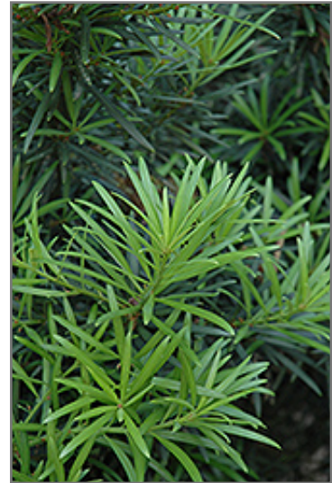
Japanese Yew foliage

When grown indoors, Japanese Yew can be expected to grow to be about 6 feet tall at maturity, with a spread of 3 feet. It grows at a slow rate, and under ideal conditions can be expected to live for approximately 50 years. This houseplant will do well in a location that gets either direct or indirect sunlight, although it will usually require a more brightly-lit environment than what artificial indoor lighting alone can provide. It does best in average to evenly moist soil, but will not tolerate standing water. The surface of the soil shouldn't be allowed to dry out completely, and so you should expect to water this plant once and possibly even twice each week. Be aware that your particular watering schedule may vary depending on its location in the room, the pot size, plant size and other conditions; if in doubt, ask one of our experts in the store for advice. It is not particular as to soil type or pH; an average potting soil should work just fine.