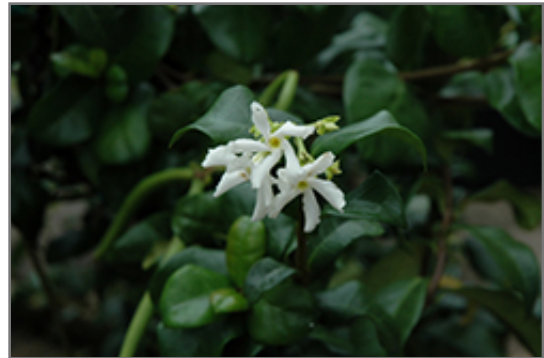
Madison Star-Jasmine flowers