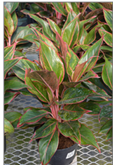
Siam Aurora Chinese Evergreen in full