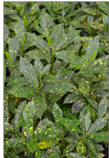
Gold Dust Variegated Croton foliage