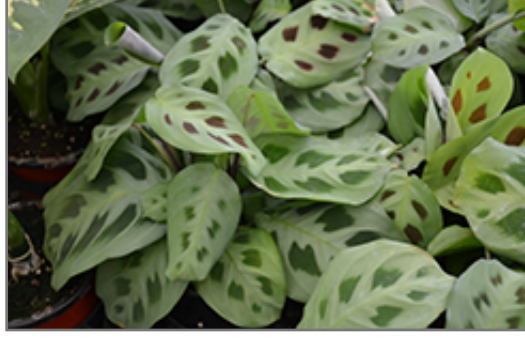
Prayer Plant foliage