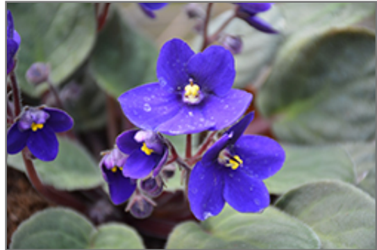
Hybrid Blue African Violet flowers