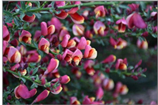
Burkwood's Broom flowers