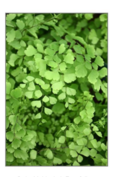
Delta Maidenhair Fern foliage

When grown indoors, Delta Maidenhair Fern can be expected to grow to be about 24 inches tall at maturity, with a spread of 24 inches. It grows at a slow rate, and under ideal conditions can be expected to live for approximately 15 years. This houseplant should be situated in a location that that gets indirect sunlight at most, although it will usually require a more brightly-lit environment than what artificial indoor lighting alone can provide. It prefers to grow in average to moist soil. The surface of the soil shouldn't be allowed to dry out completely, and so you should expect to water this plant once and possibly even twice each week. Be aware that your particular watering schedule may vary depending on its location in the room, the pot size, plant size and other conditions; if in doubt, ask one of our experts in the store for advice. It is particular about its soil conditions, with a strong preference for rich, alkaline soil. Contact the store for specific recommendations on pre-mixed potting soil for this plant. Be warned that parts of this plant are known to be toxic to humans and animals, so special care should be exercised if growing it around children and pets.