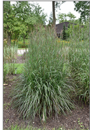
Blackhawks Bluestem in bloom