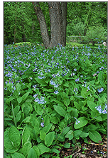
Virginia Bluebells in bloom