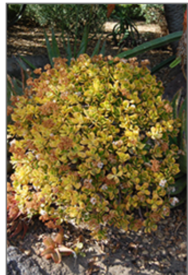
Hummel's Sunset Golden Jade Plant in bloom