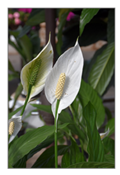
Peace Lily flowers

When grown indoors, Peace Lily can be expected to grow to be about 30 inches tall at maturity, with a spread of 30 inches. It grows at a medium rate, and under ideal conditions can be expected to live for approximately 10 years. This houseplant performs well in both bright or indirect sunlight and strong artificial light, and can therefore be situated in almost any well-lit room or location. It prefers to grow in average to moist soil. The surface of the soil shouldn't be allowed to dry out completely, and so you should expect to water this plant once and possibly even twice each week. Be aware that your particular watering schedule may vary depending on its location in the room, the pot size, plant size and other conditions; if in doubt, ask one of our experts in the store for advice. It is particular about its soil conditions, with a strong preference for rich, acidic soil. Contact the store for specific recommendations on pre-mixed potting soil for this plant. Be warned that parts of this plant are known to be toxic to humans and animals, so special care should be exercised if growing it around children and pets.