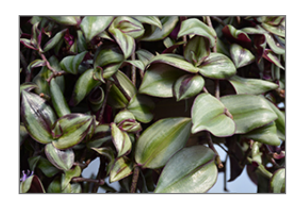
Silver Plus Wandering Jew foliage

When grown indoors, Silver Plus Wandering Jew can be expected to grow to be about 12 inches tall at maturity, with a spread of 3 feet. It grows at a fast rate, and under ideal conditions can be expected to live for approximately 10 years. This houseplant performs well in both bright or indirect sunlight and strong artificial light, and can therefore be situated in almost any well-lit room or location. It prefers to grow in average to moist soil. The surface of the soil shouldn't be allowed to dry out completely, and so you should expect to water this plant once and possibly even twice each week. Be aware that your particular watering schedule may vary depending on its location in the room, the pot size, plant size and other conditions; if in doubt, ask one of our experts in the store for advice. It is not particular as to soil type or pH; an average potting soil should work just fine.