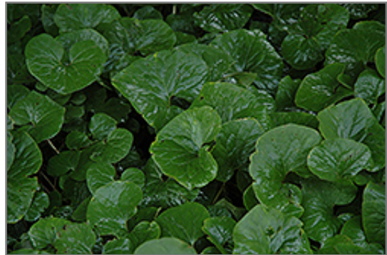
Canadian Wild Ginger