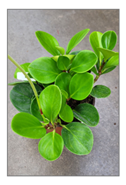
Baby Rubber Plant foliage

When grown indoors, Baby Rubber Plant can be expected to grow to be about 12 inches tall at maturity, with a spread of 12 inches. It grows at a medium rate, and under ideal conditions can be expected to live for approximately 5 years. This houseplant performs well in both bright or indirect sunlight and strong artificial light, and can therefore be situated in almost any well-lit room or location. It prefers to grow in average to moist soil. The surface of the soil shouldn't be allowed to dry out completely, and so you should expect to water this plant once and possibly even twice each week. Be aware that your particular watering schedule may vary depending on its location in the room, the pot size, plant size and other conditions; if in doubt, ask one of our experts in the store for advice. It will benefit from a regular feeding with a general-purpose fertilizer with every second or third watering. It is not particular as to soil pH, but grows best in rich soil. Contact the store for specific recommendations on pre-mixed potting soil for this plant.