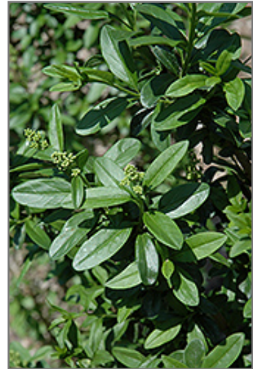
California Privet foliage