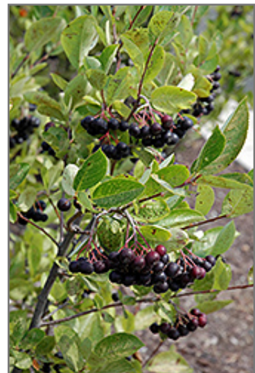
Iroquois Beauty Black Chokeberry fruit