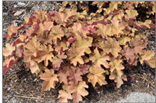
Caramel Coral Bells

Caramel Coral Bells will grow to be about 10 inches tall at maturity extending to 18 inches tall with the flowers, with a spread of 18 inches. When grown in masses or used as a bedding plant, individual plants should be spaced approximately 15 inches apart. Its foliage tends to remain low and dense right to the ground. It grows at a medium rate, and under ideal conditions can be expected to live for approximately 10 years. As an evergreen perennial, this plant will typically keep its form and foliage year-round.