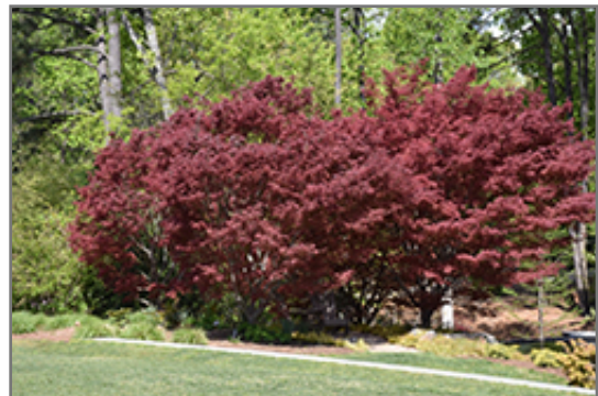
Suminagashi Japanese Maple