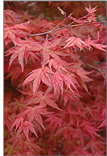
Suminagashi Japanese Maple foliage

This tree does best in full sun to partial shade. You may want to keep it away from hot, dry locations that receive direct afternoon sun or which get reflected sunlight, such as against the south side of a white wall. It prefers to grow in average to moist conditions, and shouldn't be allowed to dry out. It is not particular as to soil pH, but grows best in rich soils. It is somewhat tolerant of urban pollution, and will benefit from being planted in a relatively sheltered location. Consider applying a thick mulch around the root zone in winter to protect it in exposed locations or colder microclimates. This is a selected variety of a species not originally from North America.