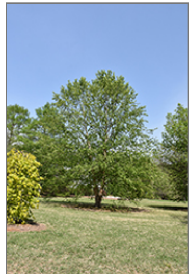
Dura Heat River Birch