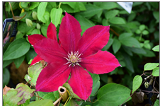
Rebecca Clematis flowers