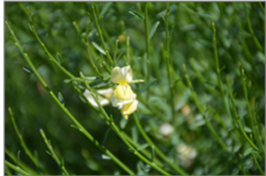
Moonlight Scotch Broom flowers

Moonlight Scotch Broom will grow to be about 5 feet tall at maturity, with a spread of 5 feet. It tends to fill out right to the ground and therefore doesn't necessarily require facer plants in front, and is suitable for planting under power lines. It grows at a medium rate, and under ideal conditions can be expected to live for approximately 20 years.