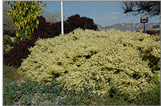
Moonlight Scotch Broom in bloom