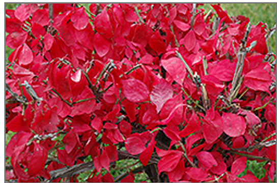
Compact Winged Burning Bush in fall