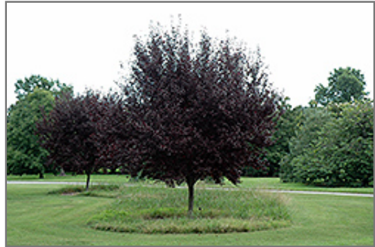
Krauter Vesuvius Plum

* This is a 'special order' plant - contact store for details