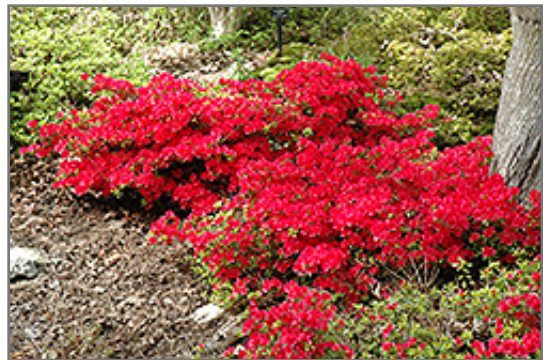
Hino Crimson Azalea in bloom