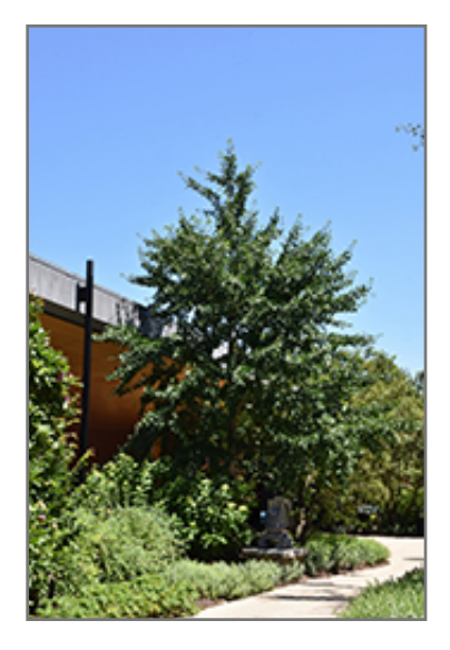
Autumn Gold Ginkgo