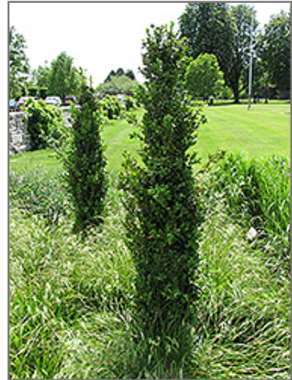
Graham Blandy Boxwood