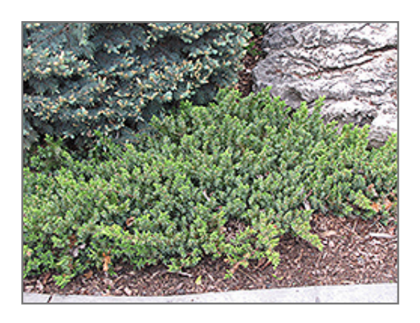
Dwarf Japanese Garden Juniper

This is a relatively low maintenance shrub, and is best pruned in late winter once the threat of extreme cold has passed. Deer don't particularly care for this plant and will usually leave it alone in favor of tastier treats. It has no significant negative characteristics.