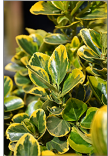
Gold Variegated Japanese Euonymus foliage

Gold Variegated Japanese Euonymus is recommended for the following landscape applications;