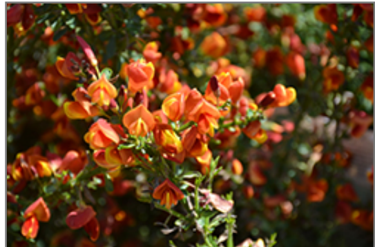
Lena Scotch Broom flowers