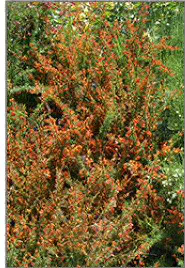
Lena Scotch Broom in bloom

This shrub should only be grown in full sunlight. It prefers dry to average moisture levels with very well-drained soil, and will often die in standing water. It is considered to be drought-tolerant, and thus makes an ideal choice for xeriscaping or the moisture-conserving landscape. It is particular about its soil conditions, with a strong preference for clay, alkaline soils, and is able to handle environmental salt. It is highly tolerant of urban pollution and will even thrive in inner city environments. This particular variety is an interspecific hybrid.