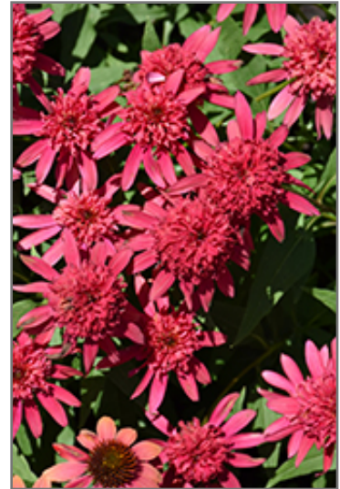
Double Scoop Raspberry Coneflower flowers