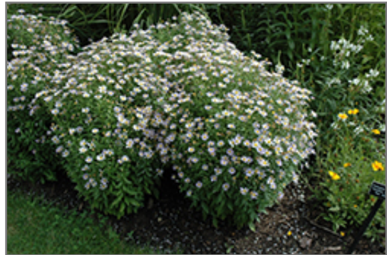
Blue Star Japanese Aster in bloom