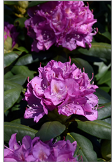
Roseum Elegans Rhododendron flowers