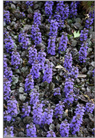
Black Scallop Bugleweed flowers

Black Scallop Bugleweed is recommended for the following landscape applications;