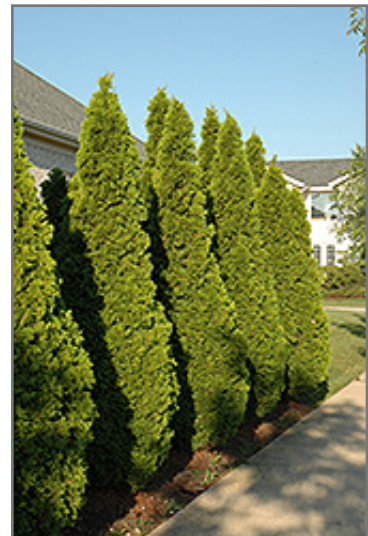
Emerald Green Arborvitae