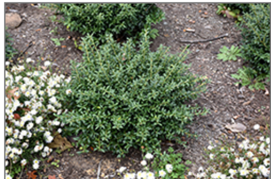
Soft Touch Japanese Holly